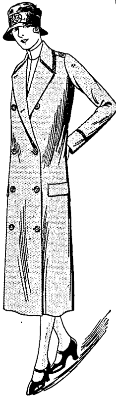
THE RODNEY (See above)